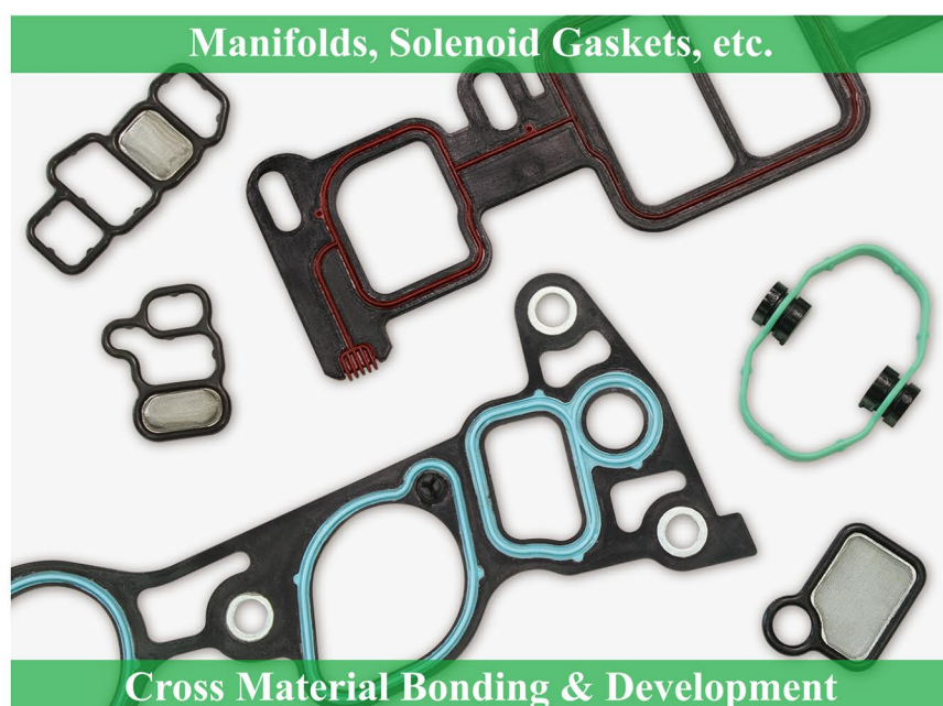
Manifolds, Solenoid Gaskets, etc.